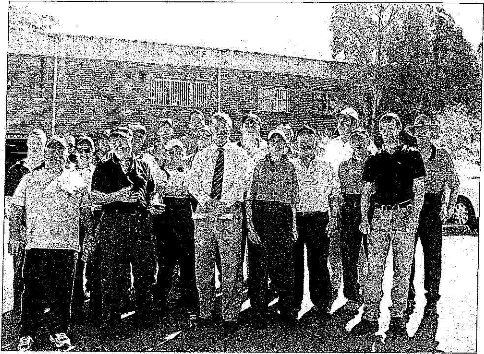
Triumphant toilers: The Eloura grounds and maintenance team celebrate their national award win.